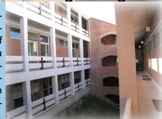
High Voltage Block